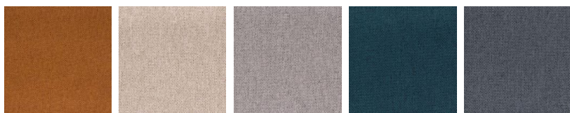
Caramel Ecu Greystone Lagoon Pepperstone